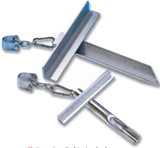
☒ Heavy Duty Turf Anchor (top) Turf Anchor (bottom)