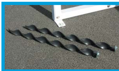
❑ Spirafix Kit