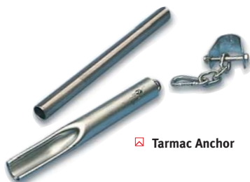
☒ Tarmac Anchor