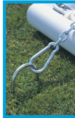
☒ 'U' Peg Anchor