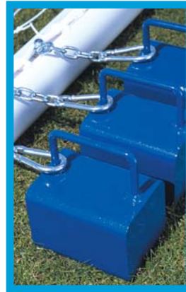
☒ Counterbalance Weight Anchor