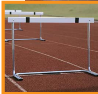
☒ H8 Junior Practice Hurdle