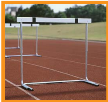
☒ H7 Schools Practice Hurdle

Competition and practice hurdles to suit all requirements. Each supplied complete with laths which can be screen printed on request.