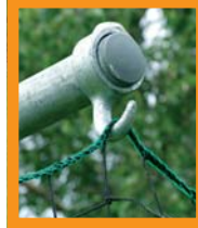
Practice Discus Cage and Netting