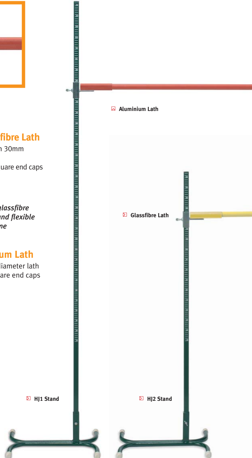
☒ Aluminium Lath