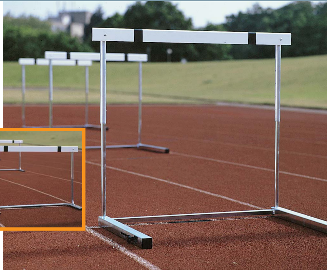
☒ H6 Fixed Leg Competition Hurdle