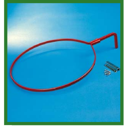
☒ Drop-in Ring