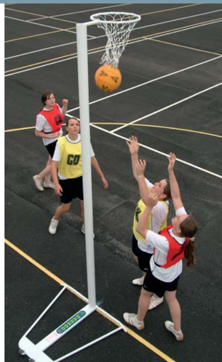
☒ Freestanding International Posts