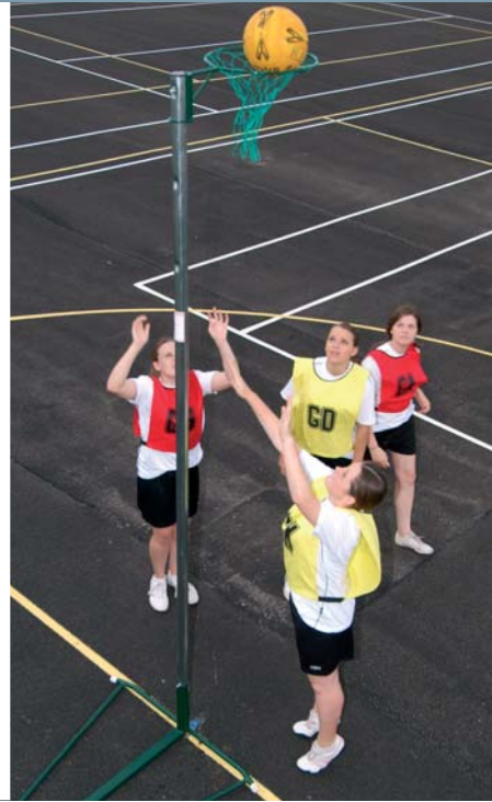
☒ NB1A Wheelaway Posts