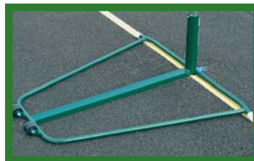
☒ NB1AR/NB1A Wheelaway Base