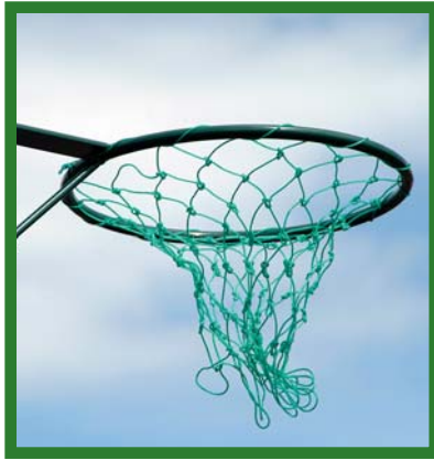
☒ Regulation Netball Ring