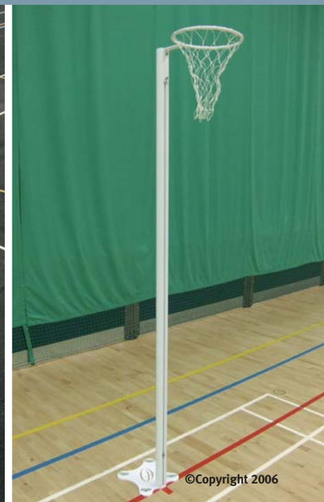
☒ Floor Fixed International Posts

It is strongly recommended that all freestanding netball posts are stored horizontally when not in use