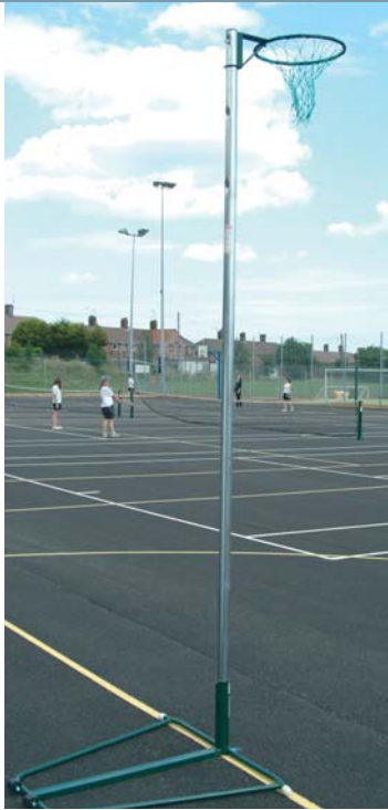
☒ NB1AR Regulation Posts