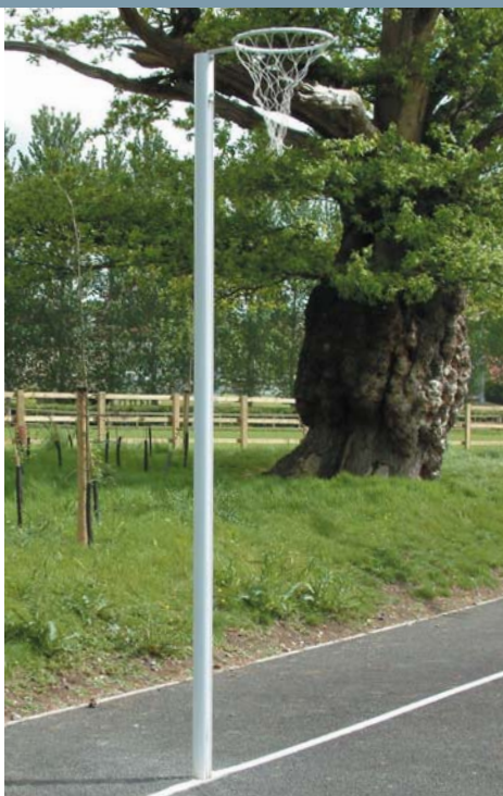
☒ Socketed International Posts