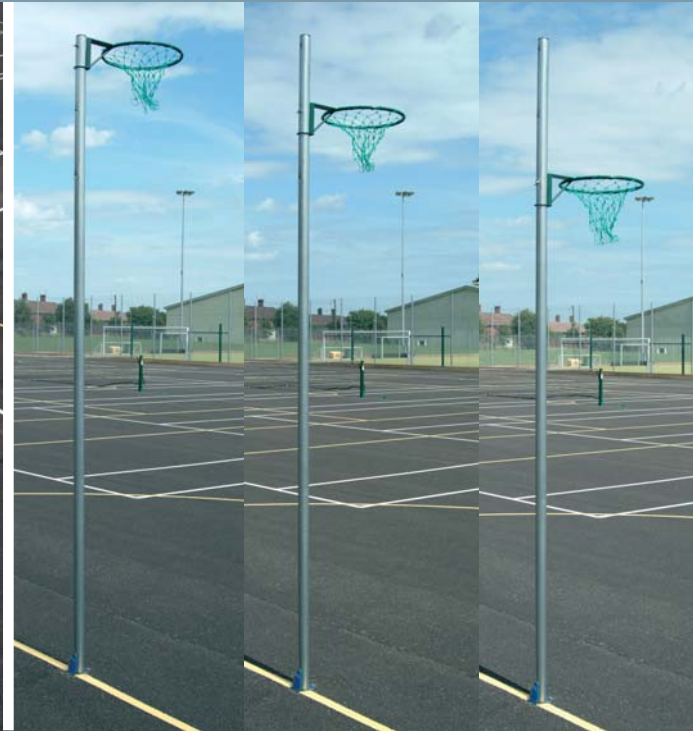
☒ NB3R Socketed Posts at 3.05m, 2.75m & 2.5m heights