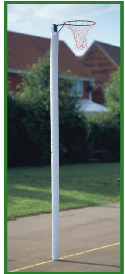
☒ NB3 Post with Standard Post Protectors